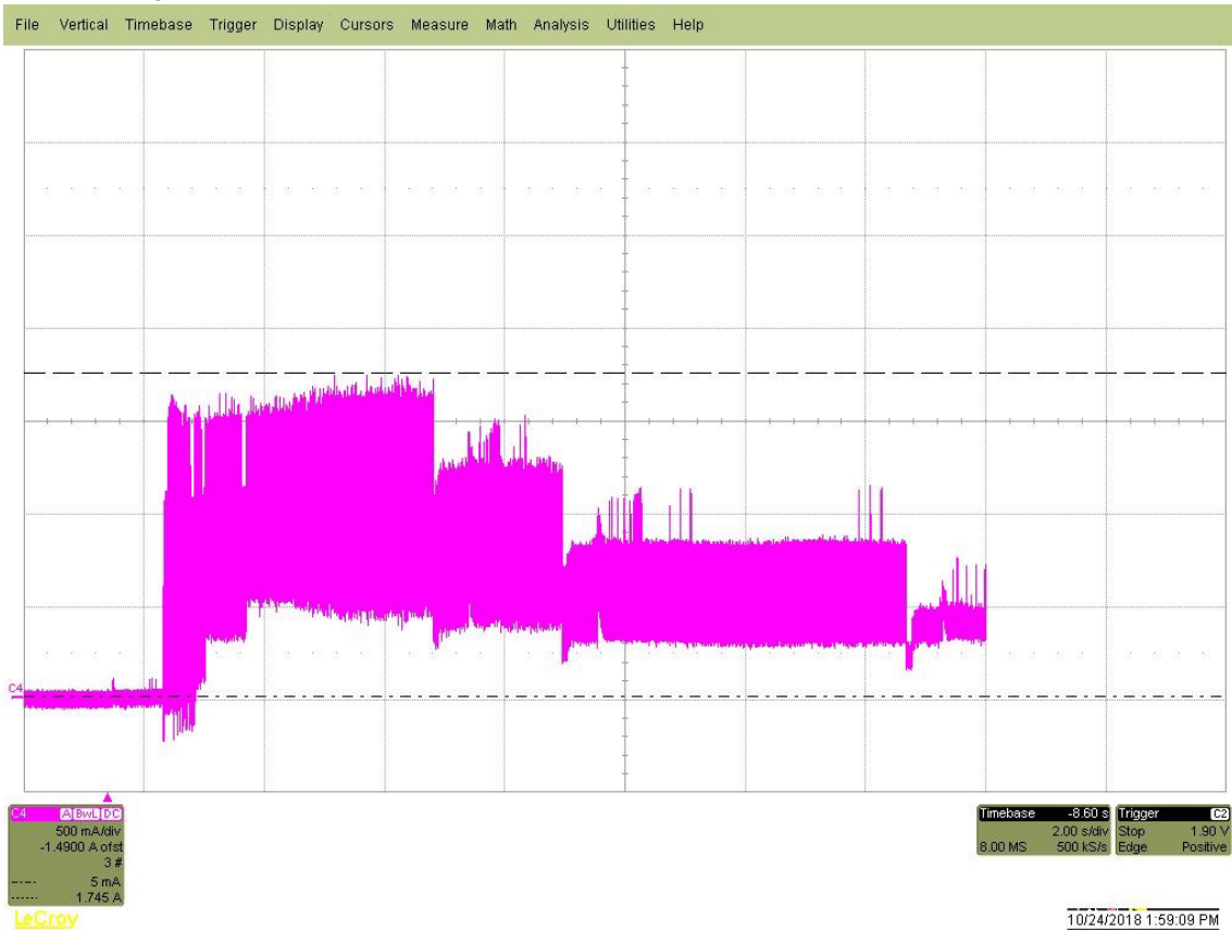
Figure 1. 8TB Typical 12V startup and operation current profile